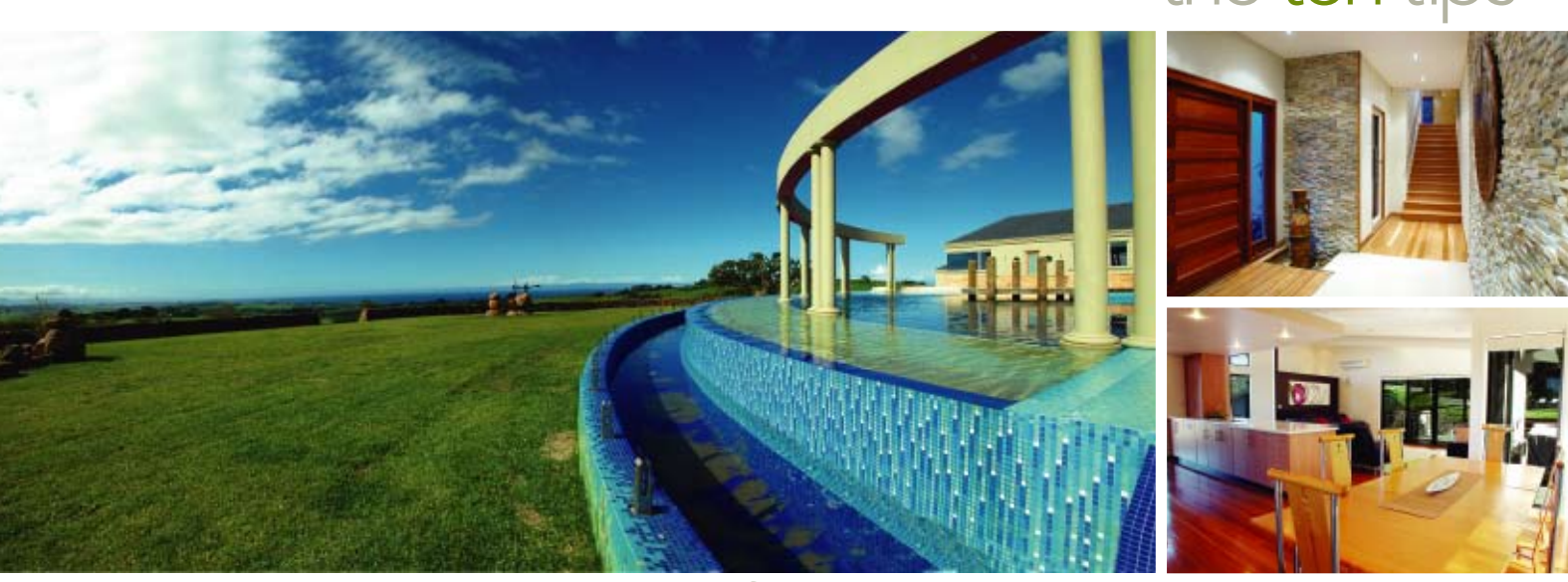
for great property presentation